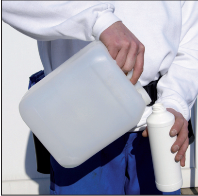
Fill the bottle with de-mineralised water.