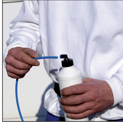
Connect the bottle top to the control unit. (Blue connection)