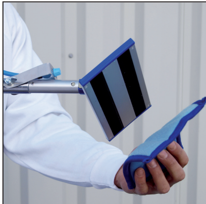
Attach the Microfiber pad to the pad holder.