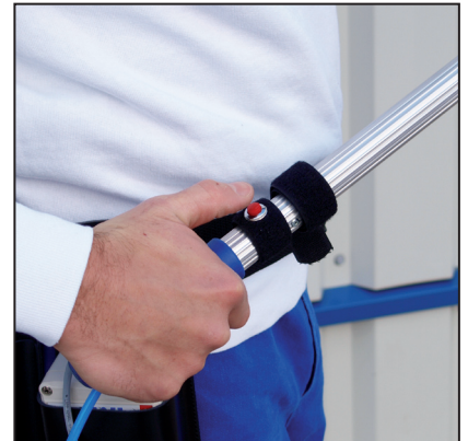
Keep the red push button pressed down until water runs out of the top end of the hose (see next picture).