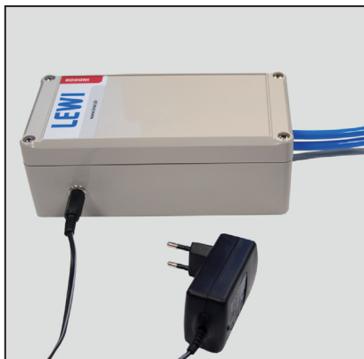
Connect charger to control unit. Unit is fully charged when LED on charger changes from red to green.

Charge level indicator: Please charge system when the light is red.